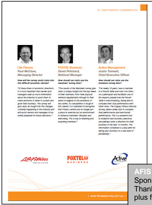
AFIS Report Sponsor comments page Thanks to Sponsors page plus full A4 page advert.