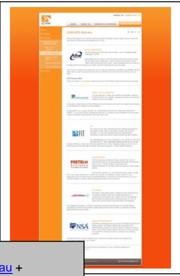
Sponsor page www.ezypay.com.au + www.fitnesssurvey.com.au