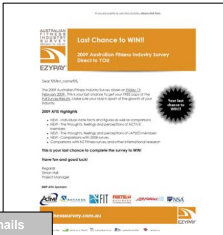
Notification emails Sent to all clubs