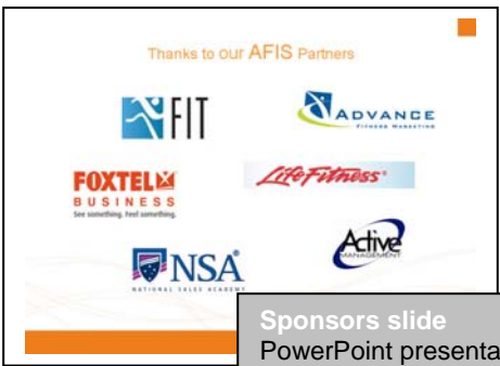
Sponsors slide PowerPoint presentation at Filex AFIS highlights + launch video - YouTube, Facebook, Website etc